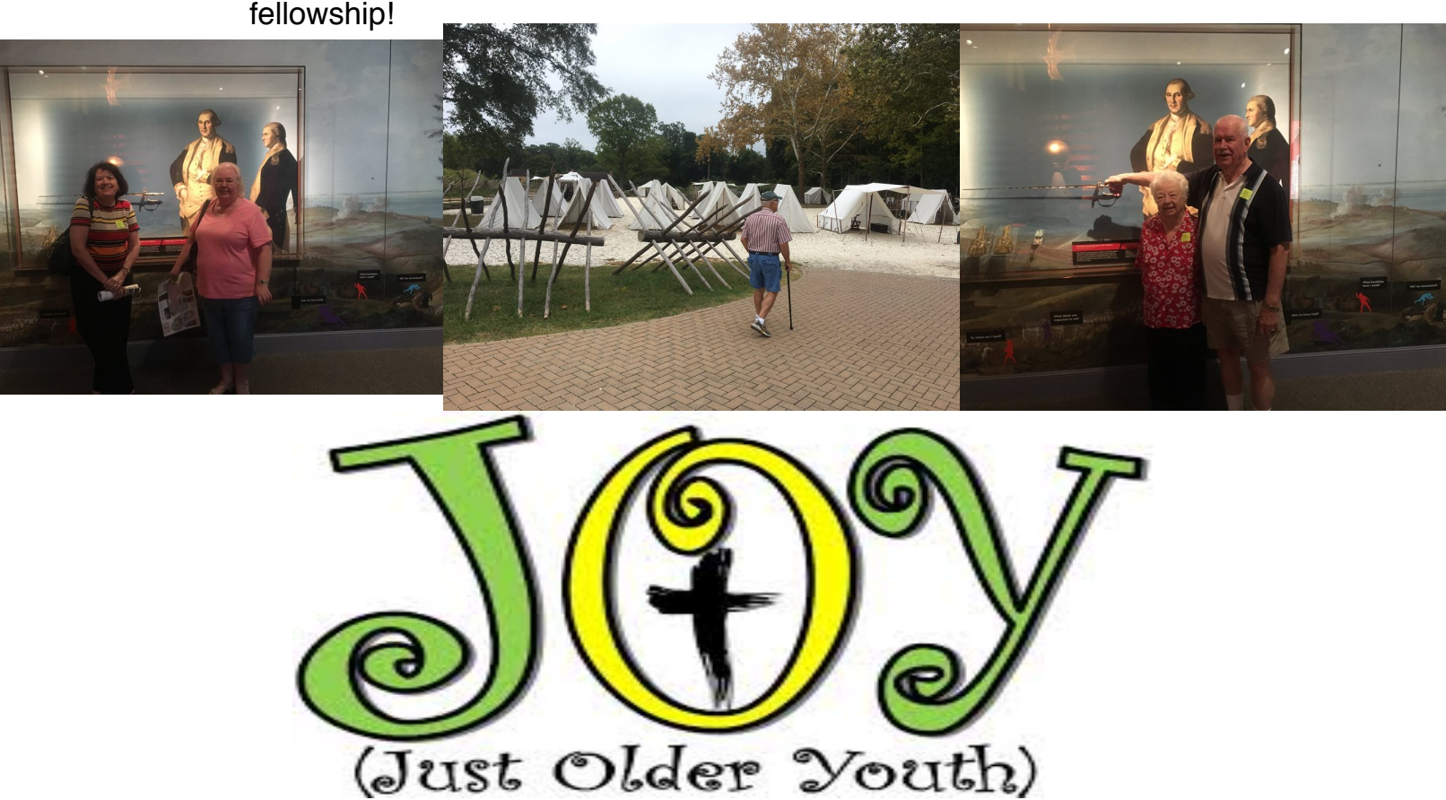
The JOY Ministry has two outings planned for October. We hope you'll be able to join us, and you don't have to be a JOY member to go with us and enjoy fun and fellowship!

The KBC JOY Group traveled to Yorktown on Tuesday, September 26th, to visit the new Yorktown Museum. They took a trolley to tour the town and visited the numerous shops at the waterfront. Afterwards, they enjoyed lunch and the view from the waterfront. It was an afternoon of great followed: